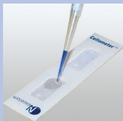
Pipette 20 µl of Sample