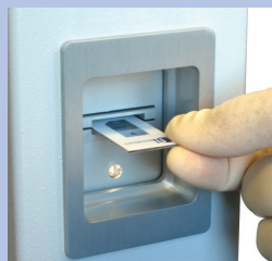
Insert Disposable Slide